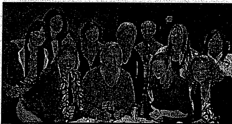
Network and Learn With Your Fellow Treasurers

January 17 - 18, 2019 ~ Attend One or Both Days ~ Lansing Crowne Plaza West